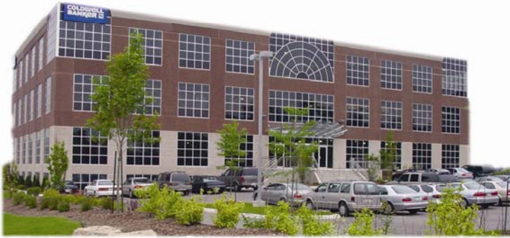
508 Riverbend Drive, Kitchener